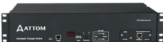
Intelligent ATS (2U)